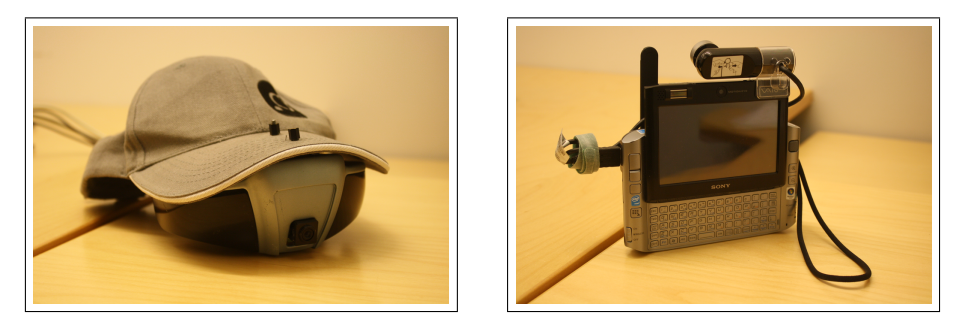
Fig. 2. The display devices. On the left, wearable near-to-eye display with integrated gaze tracker. On the right, hand-held computer with virtual see-through display.

The head-mounted device is a research prototype provided by Nokia Research Center [9]. VGA quality image is displayed with a 30 degree field of view. The hand-held PC is an ultra-mobile Sony Vaio computer with a 4.5 inch display.