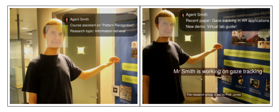
Fig. 1. Screenshots from the Virtual Laboratory Guide. Left: The guide shows augmented information about a recognized person. Right: The guide has recognized that the user is interested in research-related information.